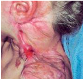
Hypertrophic & Keloid scars