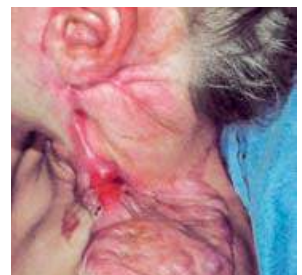
Hypertrophic & Keloid scars